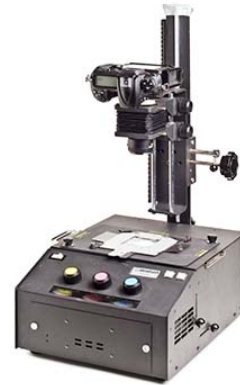
Figure 7 Beseler Dual Mode Slide Duplicator

For 35mm, the fastest configuration we found was by use of a system where the film stage – made from a Nikon PS-5 slide copy adapter - was affixed to an adjustable rail arrangement (Figure 6). Lighting was provided by means of a softbox attached to an electronic flash.