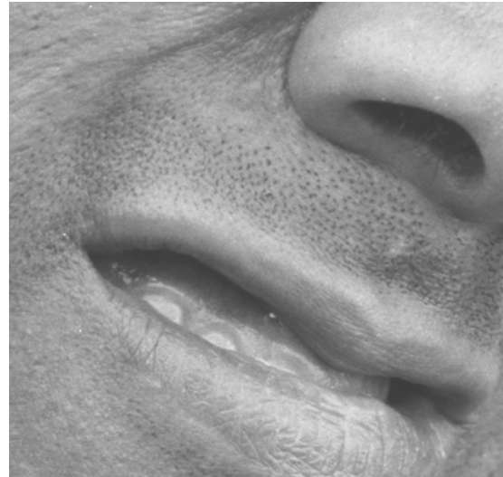
Figure 4 Here's a sample from a Nikon 8000 scanner created at 4000 PPI resolution.

Different film types present both opportunities and challenges for camera scanning. In general, we have found that camera scanning is extremely well-suited to black and white negatives, very good for color transparency, and least useful (currently, for reproduction purposes) for color negative.