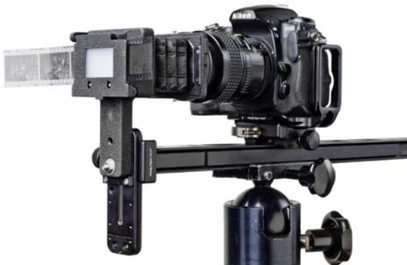
Figure 6 Really Right Stuff Camera Rail with Nikon PS-5 negative stage.

Note that this is a particularly demanding technical usage of a digital camera, and any imperfections in the imaging pipeline can show up here. In particular, we found that diffraction limitations showed up when stopped down too much. This had to be balanced against the fact that the film was not being held perfectly flat. We found acceptable compromises in the range of f/8 that had no apparent depth of field issues, nor was diffraction limitation observed.