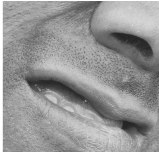
Figure 5 Here's the same image scanned with a Canon 1DsMkIII camera. Neither of these images have been sharpened.